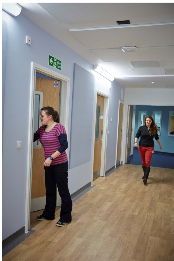
Figure 3 It can be difficult to find images of psychiatric inpatient spaces on many organisations’ websites. From the Oxford Health NHS Foundation Trust Highfield Unit: http://www.oxfordhealth.nhs.uk/highfieldunit/our-services/ .